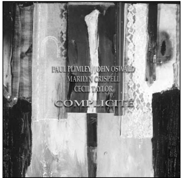
© SOCIÉTÉ RADIO-CANADA © Les Éditions Victoriaville et Les Disques VICTO, SOCAN 2001